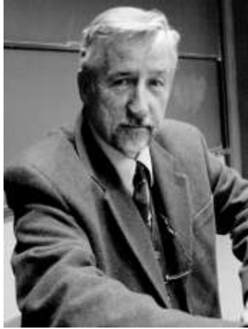
Tom Hayden, Professor, Author, Politician, Social and Political Activist, Environmentalist